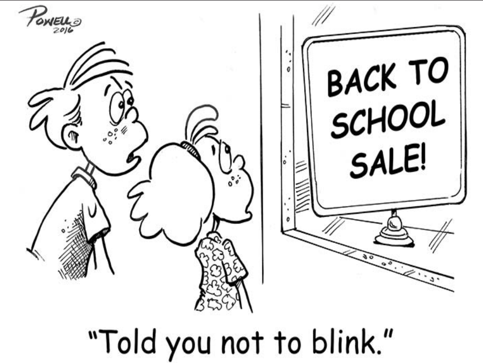
"Told you not to blink."

Contact the Towns County Herald 706-896-4454